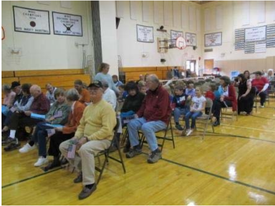
Veterans Day at MCS